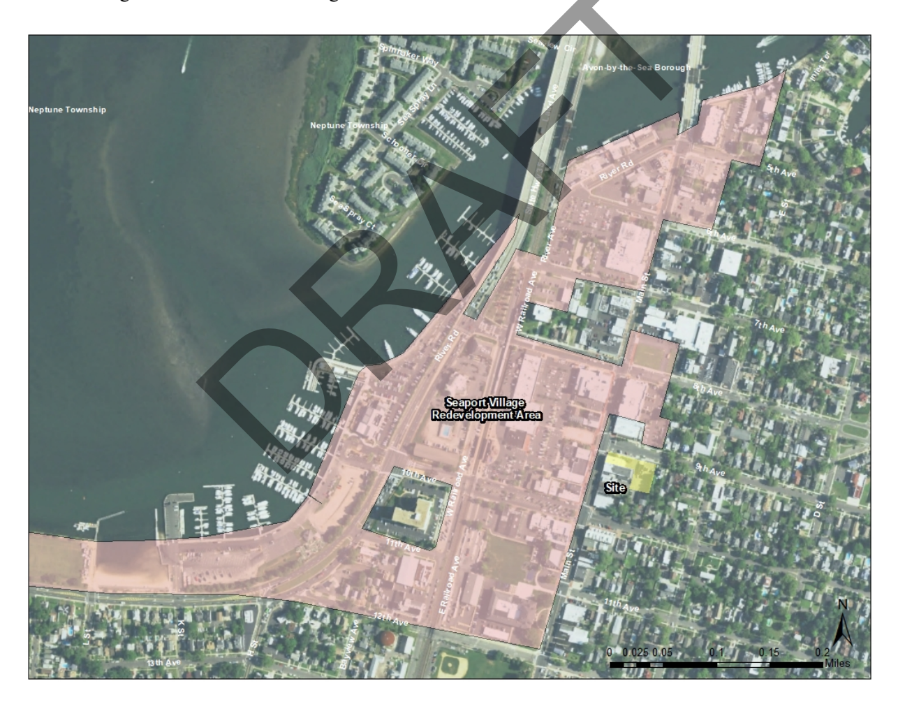
Figure 2 Redevelopment Area in Relationship to the Seaport Village Redevelopment Area

The Census Bureau's 2013-2017 American Community Survey showed that median household income was $74,942 and the median family income was $93,144. The per capita income for the Borough was $47,217 and about 9.5% of families and 11.8% of the population were below the poverty line, including 22.5% of those under age 18 and 5.0% of those age 65 or over.