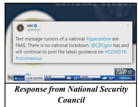
Response from National Security Council