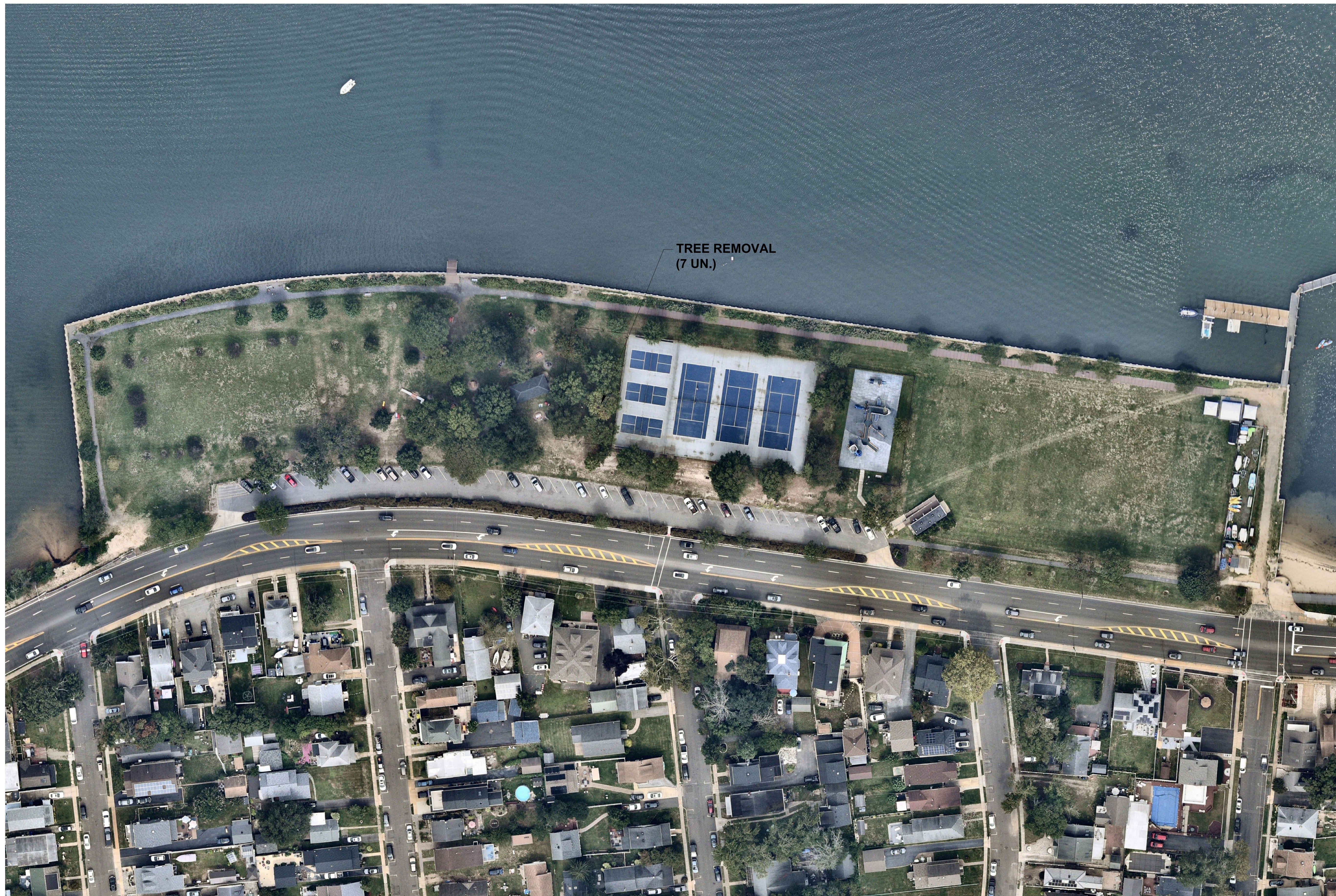
EXISTING CONDITIONS: PICKLEBALL COURTS AT MACLEARIE PARK SCALE: 1"=50'