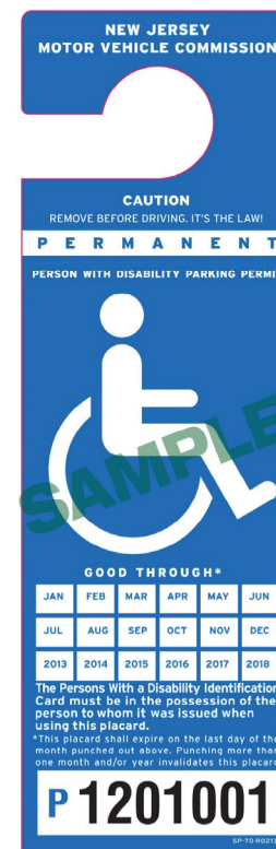
FIGURE 2: Permanent Person with a Disability Placard